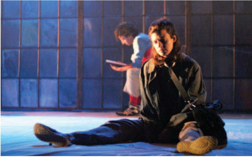
Picture 2: Actors perform in Wajdi Mouawad's play Incendies ( Scorched ) at Masrah Al-Madina during the Samir Kassir Foundation's May 2013 Beirut Spring Festival.