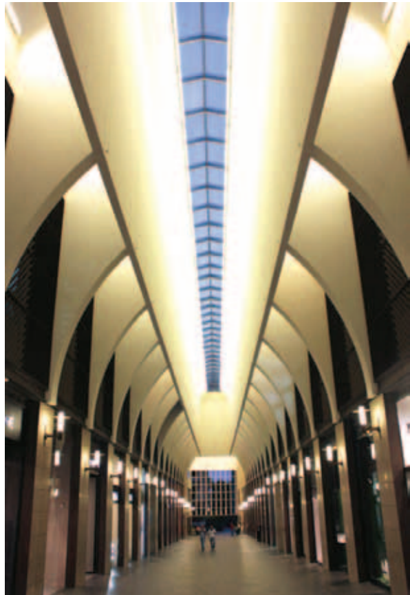
Picture 5: Inside Beirut Souks, a high-end shopping center constructed on the location of the city's old public markets.

Hand in hand with the lack of educational emphasis, the absence of governmental support for arts and culture is another major impediment to the arts playing a bigger role in public life. “In Beirut there is a big problem: there is no art museum,” Abdelrahman Katanani says. It is important to have a museum with a permanent collection of contemporary art so the public can be exposed and come back to study the same pieces over and over again, he continues. The closest thing Beirut has to a state-sponsored museum is the Sursock Museum, but it is currently under renovation and closed to the public. Not having a public art museum is strange for a city with the reputation Beirut has, Katanani says. Other countries have government-supported art museums. In Beirut, these types of institutions are always private and mostly geared towards making money and not education, he concludes.